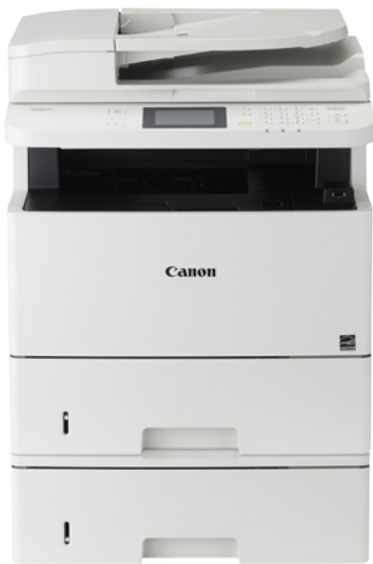
Main unit + 1 Paper Feeder Unit PF-45