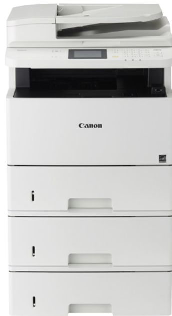
Main unit + 2 Paper Feeder Units PF-45