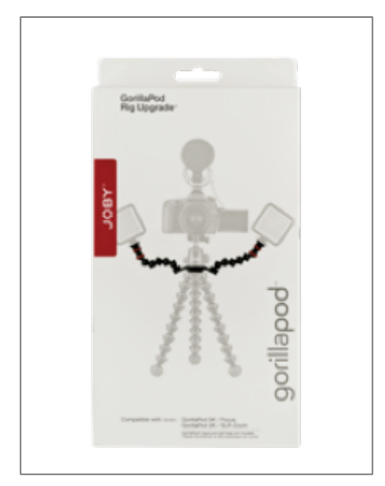
Pair with GorillaPod 5K Kit or GorillaPod 3K Kit. Box Dimensions:

13.5 x 4.5 x 23.5 cm 5.31 x 1.77 x 5.89 in