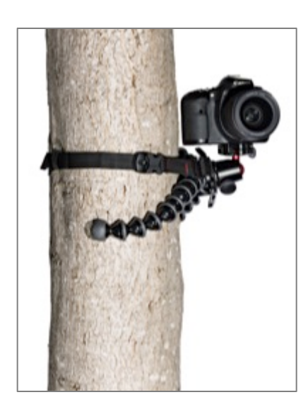
Securely mount with quick-release strap.

13.5 x 4.5 x 23.5 cm 5.31 x 1.77 x 5.89 in