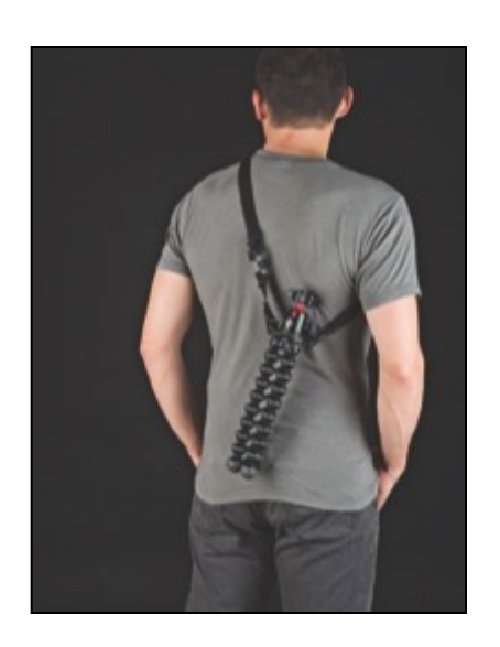
Quick-release strap is great for sling carry.