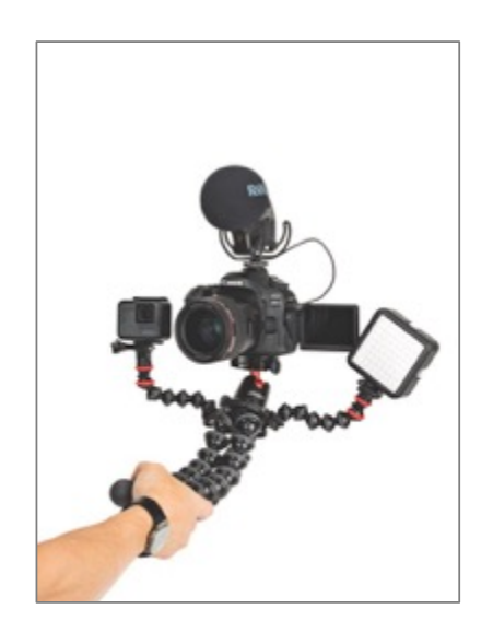
Add lights, mics and more to create the ultimate video rig.