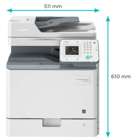
iRC1225iF 511 mm x 549 mm x 610 mm

All specifications subject to change without notice