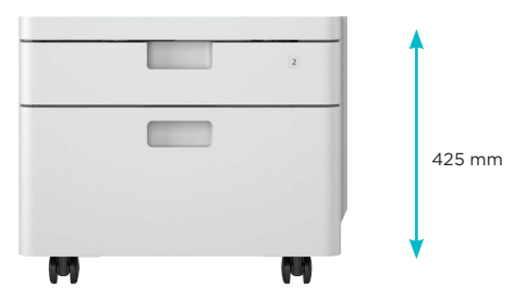
Cassette Feeding Unit-AJ1