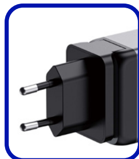
EU Type C