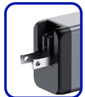
US Type A