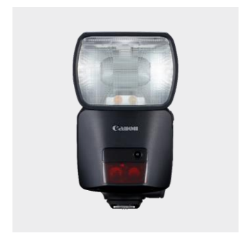
Canon Speedlite EL-1