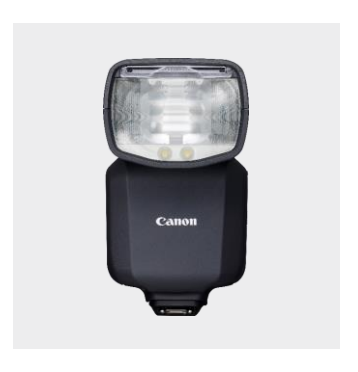
Canon Speedlite EL-5