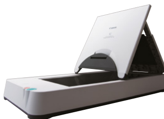
Optional A4 Flatbed Scanner Unit 101

The DR-M1060 comes with a host of optional accessories that enable users to be even more productive. The A4 and A3 optional Flatbed Scanner units allow users to scan bound books, journals and fragile media. These USB-connected dual-scanning flatbed units work seamlessly with the DR-M1060, so users can apply the same image-enhancement features to any scan. A 2D Barcode Module is also available that enables barcode recognition of QR codes, PDF417 and Data Matrix formats.