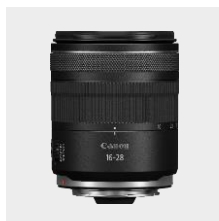
RF 16-28mm F2.8 IS STM