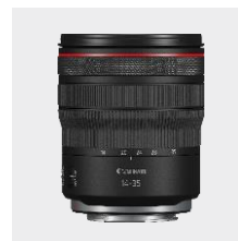
RF 14-35mm F4L IS USM