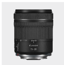
RF 15-30mm F4.5-6.3 IS STM