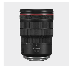
RF 15-35mm F2.8L IS USM