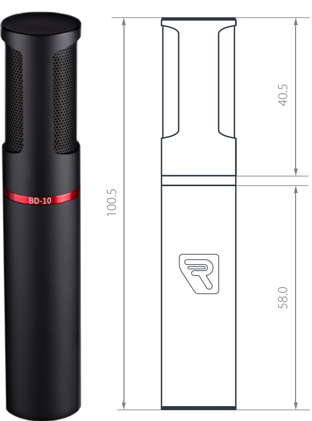
*dimensions in mm

The Rycote BD-10 is a bidirectional (Figure of 8) condenser microphone designed mainly for M/S stereo and ambient recording as well as dual dialogue. Perfect for use with the SC-08, CA-08, HC-15 and HC-22 for a complete Rycote M/S Stereo or DM/S stereo solution. The BD-10 maintains our signature ultralow self-noise. The microphone has been manufactured with the same precision and quality that our range of professional microphones have become renowned for. Designed with the same attention to detail, it blends seamlessly into the existing family with the same tonal quality expected from the entire Rycote microphone range.